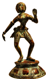
Celebration of Life in the Music City

Friday, June 24, 2011 - Theme: India Nite